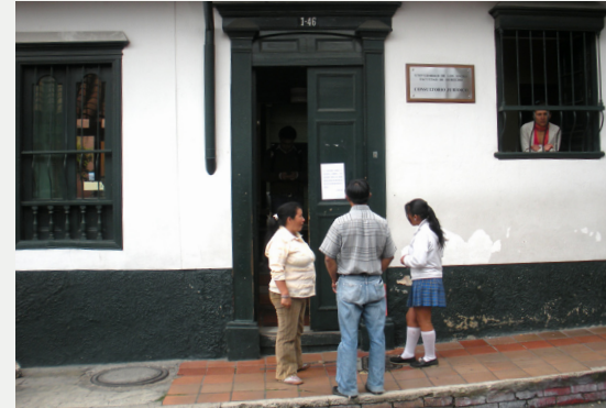
Clients outside the legal clinic of Los Andes Law School and the office of the Fundación Pro Bono Colombia in Bogota.

Expansion of the pro bono initiative in Latin America continues with new PBDA signatories in the Caribbean, Paraguay, Uruguay and Venezuela.